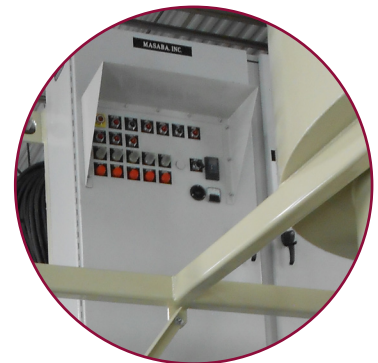
Panels & Switchgear Custom designed for your needs. Switchgear includes 100 ft. lead cord.

NOTE: SPECIFICATIONS ARE SUBJECT TO CHANGE WITHOUT NOTICE: Because Masaba, Inc. may use in its catalog & literature, field photographs of its products which may have been modified by the owners, products furnished by Masaba, Inc. may not necessarily be as illustrated therein. Also continuous design progress makes it necessary that specifications be subject to change without notice. All sales of the products of Masaba, Inc. are subject to the provisions of its standard warranty. Masaba, Inc. does not warrant or represent that its products meet any federal, state or local statutes, codes, ordinances, rules, standards or other regulations, Including OSHA and MSHA, covering safety pollution, electrical, wiring, etc. Compliance with these statutes and regulations is the responsibility of the user and will be dependent upon the areas and the use to which the product is put by the user. In some photographs, guards may have been removed for illustrative purposes only. This equipment should not be operated without all guards attached in their normal position. Placement of guards and safety equipment is often dependent upon the area and the use to which the product is put. A safety study should be made by the user of the application, and, if required, additional guards, warning signs and other safety devices should be installed by the user, wherever appropriate before operating the products.