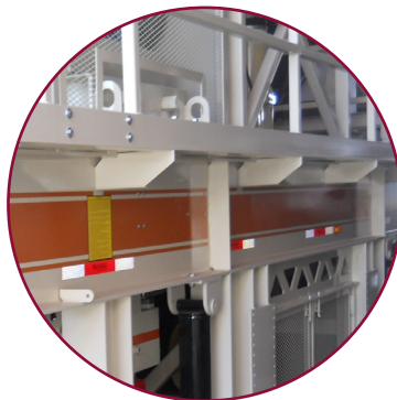
Optimized Performance Cross bracing units tied in side to side for increased rigidity.