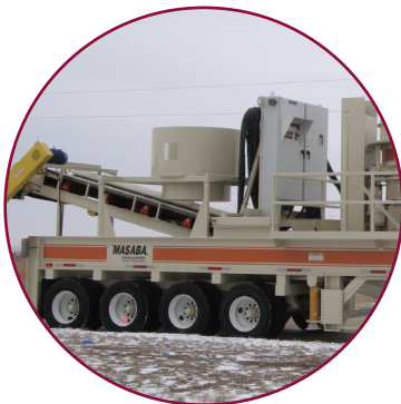
Quad Axle Chassis Constructed of Heavy-Duty wide flange beam

Transport Height: 14' - 4 1/2 " | Transport Length: 55' - 10" | Transport Width: 11' - 8" Estimated Axle Group Weight: 66,750 lbs | Estimated King Pin Weight: 47,150 lbs