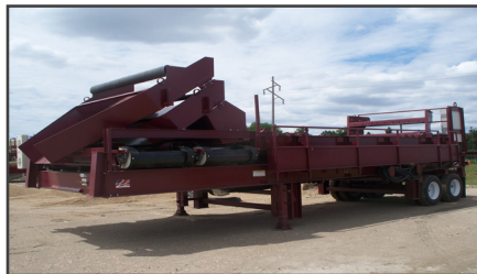
Masaba Strong Chassis