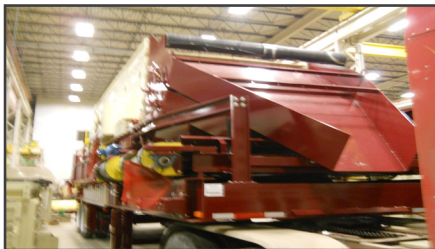
3/8" AR Steel Overs Chutes

*NOTE: Listed weights are not exact. Actual weights will vary based on screen size, brand, options, etc.*