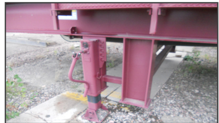
Swing Down Legs