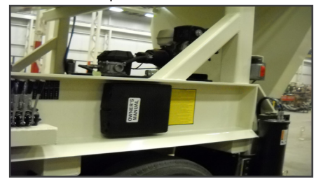
Heavy Duty Wide Flange Beam Chassis