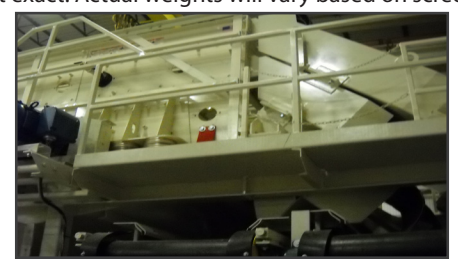
Fully Decked Platform Double 2" Handrails