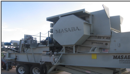
Plasma Cut Flywheel Cover

*NOTE: Listed weights are not exact. Actual weights will vary based on screen size, brand, options, etc.*