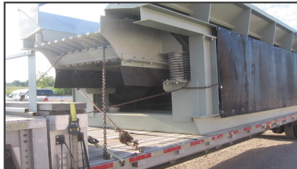
Skid-Mounted Grizzly Feeder and Hopper