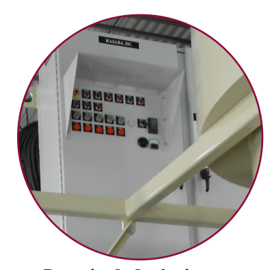
Panels & Switchgear Custom designed for your needs. Switchgear includes 100 ft. lead cord.

NOTE: SPECIFICATIONS ARE SUBJECT TO CHANGE WITHOUT NOTICE: Because Masaba, Inc. may use in its catalog & literature, field photographs of its products which may have been modified by the owners, products furnished by Masaba, Inc. may not necessarily be as illustrated therein. Also continuous design progress makes it necessary that specifications be subject to change without notice. All sales of the products of Masaba, Inc. are subject to the provisions of its standard warranty. Masaba, Inc. does not warrant or represent that its products meet any federal, state or local statutes, codes, ordinances, rules, standards or other regulations, Including OSHA and MSHA, covering safety pollution, electrical, wiring, etc. Compliance with these statutes and regulations is the responsibility of the user and will be dependent upon the area and the use to which the product is put by the user. In some photographs, guards may have been removed for illustrative purposes only. This equipment should not be operated without all guards attached in their normal position. Placement of guards and safety equipment is often dependent upon the area and the use to which the product is put. A safety study should be made by the user of the application, and, if required, additional guards, warning signs and other safety devices should be installed by the user, wherever appropriate before operating the products.