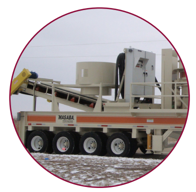
Quad Axle Chassis Constructed of HeavyDuty wide flange beam