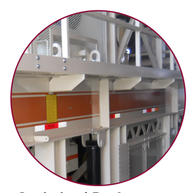
Optimized Performance Cross bracing units tied in side to side for increased rigidity.