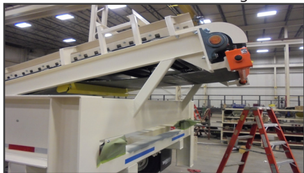
48" Discharge Conveyor Hydraulic Raise/Lower

*NOTE: Listed weights are not exact. Actual weights will vary based on axle configuration, options, etc.*