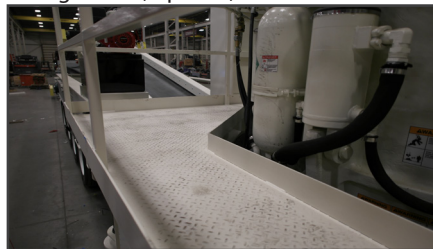
Diamond Plate Platforms Double 2" Handrails and Kickplates