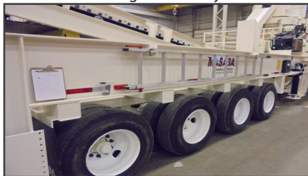
Wide Flange Beam Chassis