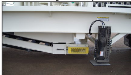
Wide Flange Beam Chassis