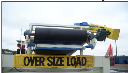
42" Discharge Conveyor Hydraulic Raise/Lower

*NOTE: Listed weights are not exact. Actual weights will vary based on axle configuration, options, etc.*