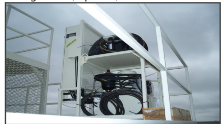
Diamond Plate Platforms Double 2" Handrails and Kickplates