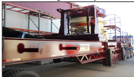
Wide Flange Beam Chassis