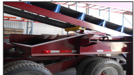
Hydraulic Raise/Lower 42" Discharge Conveyor