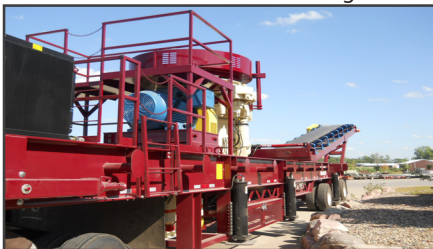
Upper and Lower Access Platforms

*NOTE: Listed weights are not exact. Actual weights will vary based on axle configuration, options, etc.*