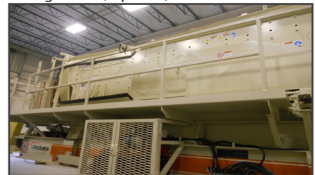
Diamond Plate Platforms Double 2" Handrails and Kickplates