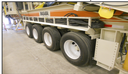
Wide Flange Beam Chassis