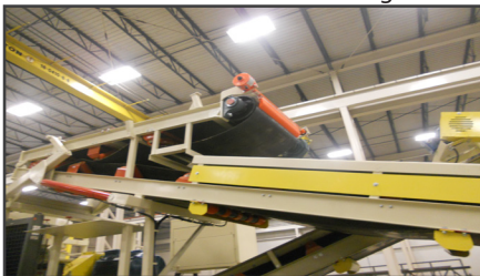
42" Over Cone Conveyor Hydraulic Fold

*NOTE: Listed weights are not exact. Actual weights will vary based on axle configuration, options, etc.*