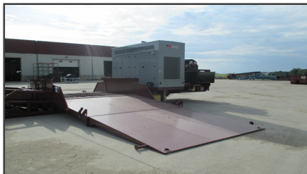
Self Cleaning Hydraulic Ramps

*NOTE: Listed weights are not exact. Actual weights will vary based on options*