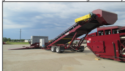
72" Discharge Conveyor with Discharge Hood