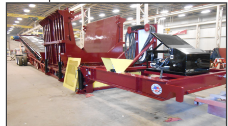
Ramps Fold for Travel