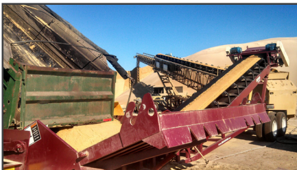
Self Cleaning Hydraulic Ramps

*NOTE: Listed weights are not exact. Actual weights will vary based on options*