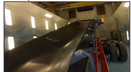
48" 3-Ply Belting Vulcanized Splice