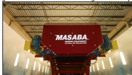
48" Discharge Conveyor with Discharge Hood